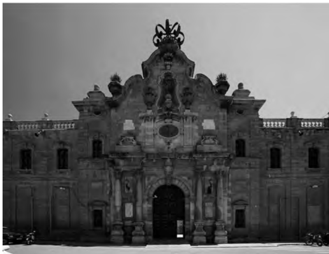
Figure 6. Facade of the Universitat de Cervera. This centre was created by Philip V in 1717 when he decreed the suppression of all the existing universities in Catalonia.

promoted by the Bourbon army fostered the creation of new institutions related to science and technology. 44