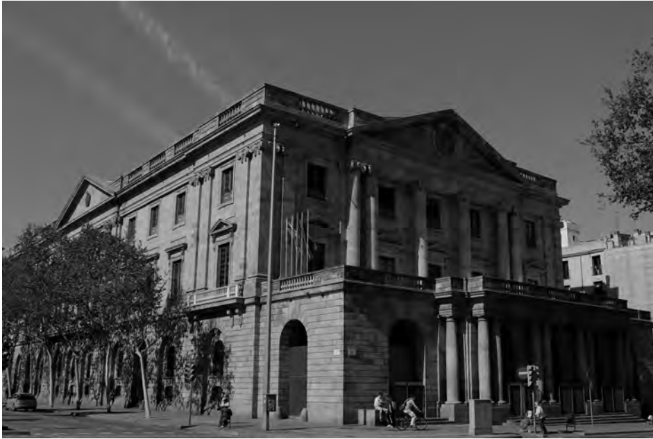
Figure 4. The building housing the Board of Trade of Barcelona, which created technical schools and chairs aimed at sharing European scientific advances. The outside is neoclassical in style and was built in the last third of the 18th century, while the interior, which is Gothic and dates from the 14th century, is the sea exchange.

the soul behind the Reial Acadèmia de Bones Lletres (Royal Academy of Belles Lettres) of Barcelona. 42