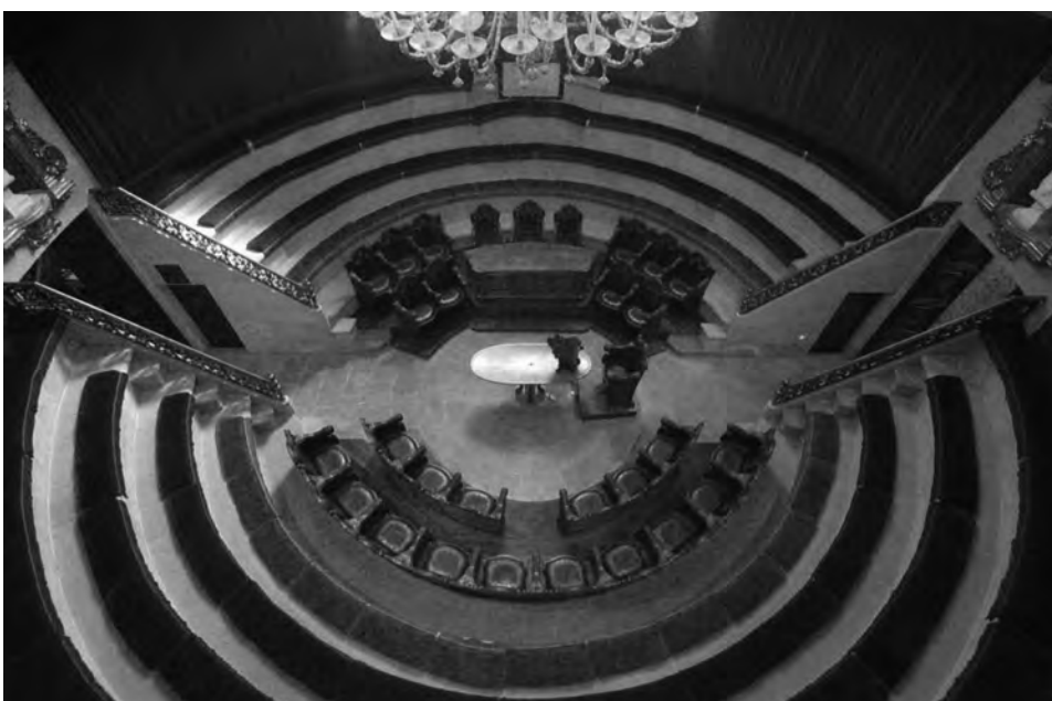
Figure 5. Gimbernat Hall. Former anatomy amphitheatre of the Royal College of Surgeons of Barcelona.

One of the characteristics of the Catalan Enlightenment is its strict ties with utilitarianism and with the new experimental science. Since the Universitat de Cervera was weak in the sciences and the Sociedades Económicas de Amigos del País (Economic Societies of Friends of the Country) never gained much ground in Catalonia – during the 18th century, only the ones in Tàrrrega (1776) and Tarragona (1786) showed some degree of continuity – the economic dynamism of Catalan society and the initiatives