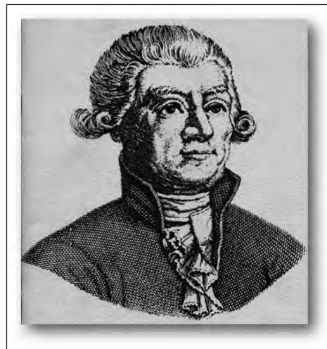
Figure 7. Antoni Gimbernat i Arbós (Cambrils, Tarragona, 1734 - Madrid, 1816). Surgeon and professor of anatomy at the Royal College of Surgeons of Barcelona.

The Acadèmia de Ciències Naturals i Arts (Academy of Natural Sciences and Arts) of Barcelona (1770) emerged from the Conferència Fisicomatemàtica Experimental (Experimental Physics-Mathematics Conference, 1764),